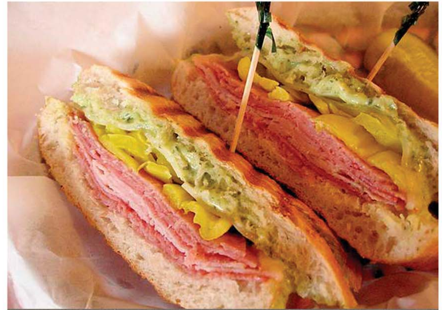
FROM LEFT: Panini Insalata from Insalata in Troy is flavor-intensive.